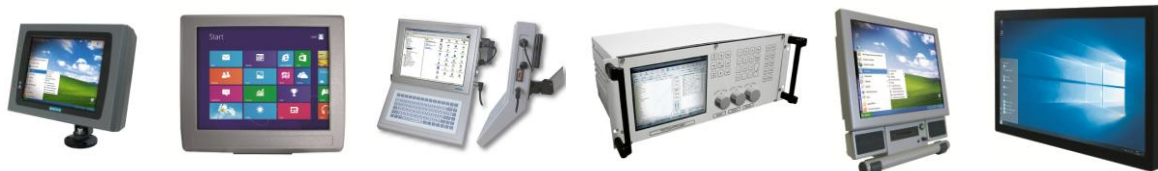
All-in-one PC for vehicles Die casting housing with 15" touchscreen IP65 housing with 12" LCD Process measurement & control system 19"/4U PC+camera+speakers+card reader SAC 55" for digital signage

We design customer-specific products even at a moderate number of items. To reduce construction cost we prefer to reuse parts from foregoing projects. That way prototypes are inexpensive and they often increase to repetition systems. Here are some examples: