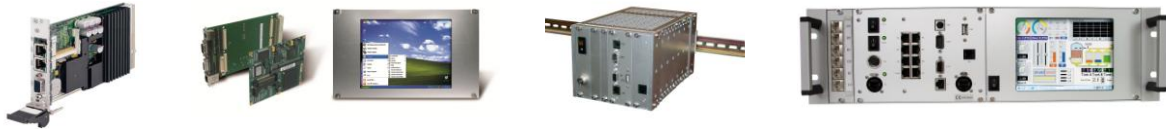
CPCI-CPU EBC-EBE + ETX module + LCD EBC 19" cassette EBC-KOM communication system

The boards of this series use the cPCI standard-bus. Another version is a low-cost single board computer consisting of a baseboard carrying an ETX CPU module. For choice there are several ETX boards of different performance. This baseboard does not need any bus in case of few I/O's; it may be equipped with an ISA/AT96-bus connector to expand the system. Additionally it may be completed by 5,7" oder 7" LCDs with resistive or a PCAP touch screen as well as some I/O-boards.