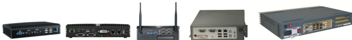
EBS-01 EBS-02 EBS-03 EBS-KPC1 EBS-KPC2

In automation technology PCs often run all-around the clock 24/7; i.e. PC-based machine controls, data collection- or communication systems. These devices do not need an operator panel as they are installed in switching cabinets, boxes or directly inside of the machine. The systems are equipped with X86- or ARM single board computers. MASS delivers computer housings according to protection class IP54 or IP65. Our housing design ensures a modular configuration of all essential PC components and interfaces.